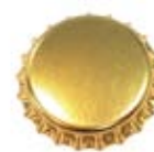
CC4801 Shiny Gold