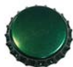
CC4298 Racing Green

Please note that the colours shown are just a guide and may differ slightly to the finished product.