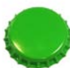
CC4817 Lime Green