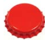
CC4805 Cherry Red