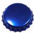
CC4309 Metallic Blue