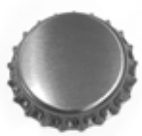
CC4808 Matte Silver